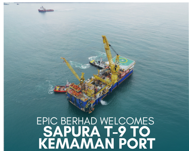
EPIC BERHAD WELCOMES SAPURA T-9 TO KEMAMAN PORT

The program facilitated collaborative strategic planning and emphasised our commitment to sustainability bolstering of business plan and streamlining the budget for 2024 and beyond.