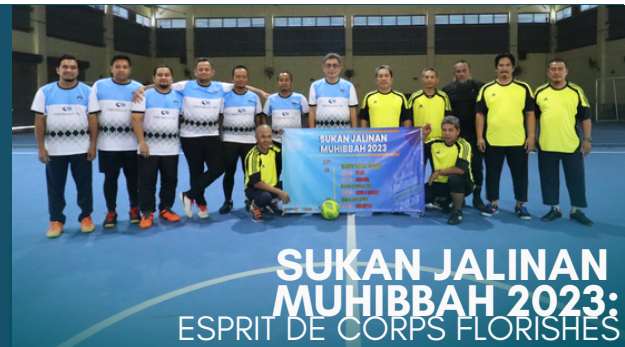
SUKAN JALINAN MUHIBBAH 2023: ESPRIT DE CORPS FLORISHES

8 September - Terengganu Inc continued to foster camaraderie and sportsmanship with Ladang Rakyat Terengganu Sdn Bhd (LRTSB) through the Sukan Jalinan Muhibbah 2023, featuring Chess and Carrom, Futsal, Ping-Pong, and Badminton. Both teams showcased collaboration and agility, with the women's Terengganu Inc team emerging as champions in Ping-Pong and Badminton.